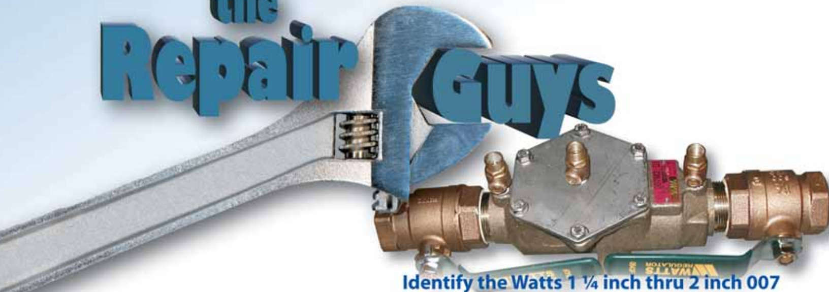
Identify the Watts 1 1/4 inch thru 2 inch 007

I n our line of work, we field questions from contractors and technicians concerning repairs, installations, and general backflow prevention practices. We'd like to share some questions that we receive as well as our answers. Everyone has different opinions on these subjects and we would like to hear yours. Contact us with questions and ideas via email at: imark@backflowparts.com or mail us at American Backflow Products Co., PO Box 37025, Tallahassee, Florida 32315.