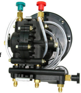
New Manifold Design