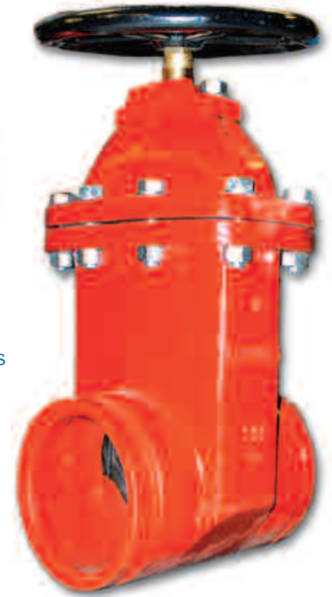
Grooved Gate Valves