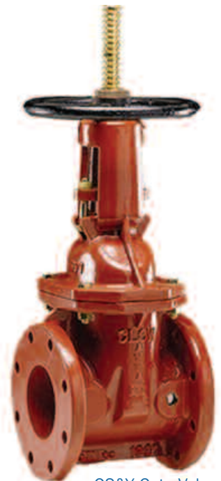
OS&Y Gate Valve

Although backflow assemblies are shipped from the manufacturer with gate valves attached, some technicians fail to realize that the manufacturer usually buys these from an outside source. So you will need to provide your supplier with the gate valve manufacturer's name (e.g. Clow, Kennedy, Mueller, and AVK etc.). Also any numbers that you find will be helpful. Most gate valves have model numbers and date codes that are important as well. The name, model number, date codes, and other important information is usually stamped or cast into the body of the gate valve itself.