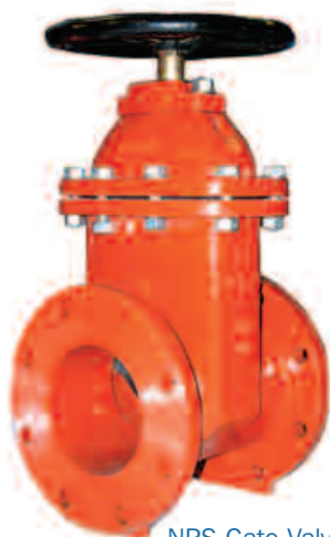
NRS Gate Valve

I would always try to repair or adjust first and replace only as a last resort. But before you get into that, we need to determine what type of gate valve you have. Inlet and outlet shut off valves for backflow assemblies come in two basic styles. A Non-Rising Stem gate valve (NRS) or an Outside Stem and Yoke gate valve (OS&Y). An NRS gate valve uses a stem that is internally sealed which simply means that the stem stays in the same vertical position whether the gate valve is opened or closed.