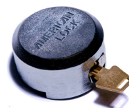
American Lock Included

SDC752: Fits 3/4" and 1" pipe sizes. Has no window for test port.